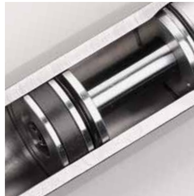
Lift cylinder – A-dec built and engineered with robust hydraulics and fewer parts.