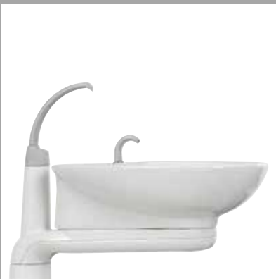
Rotating vitreous china cuspidor available