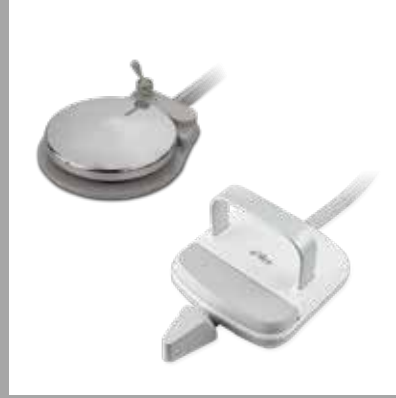
Disc or Lever foot control