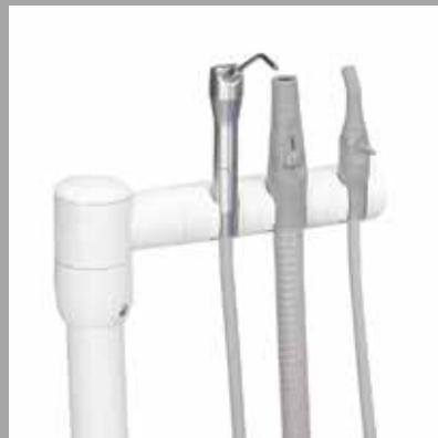
Assistant's 3-position holder with Durr HVE, saliva ejector switched holders and optional syringe