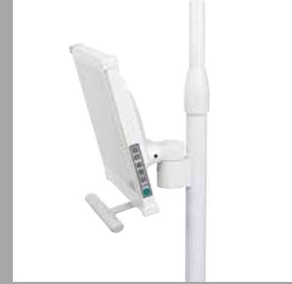
Monitor mount available