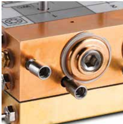
Control block – Patented design promotes clean treatment water with every activation.

A-dec has earned a reputation for creating equipment of legendary reliability and quality. It is a reputation earned through dedication to excellence, and commitment to innovative, yet simple engineering design. This means you can count on easy maintenance and a long product life.