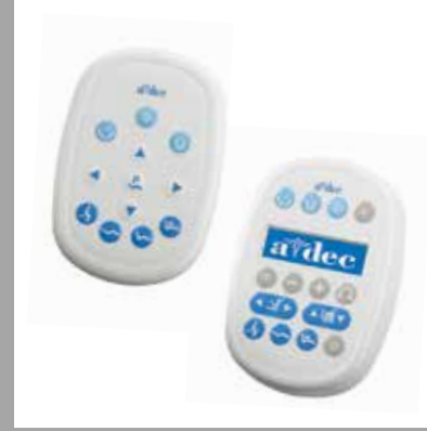
Standard or Deluxe touchpad