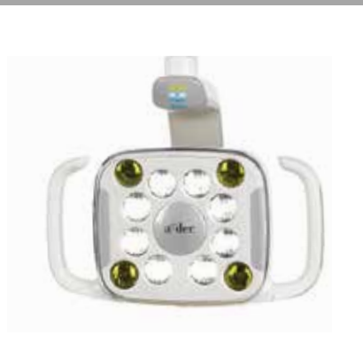
A-dec 500 LED