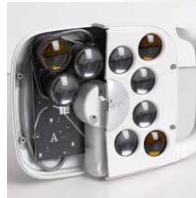
A-dec LED light – Award-winning silent design incorporates unique “passive cooling” to dissipate heat without a fan.