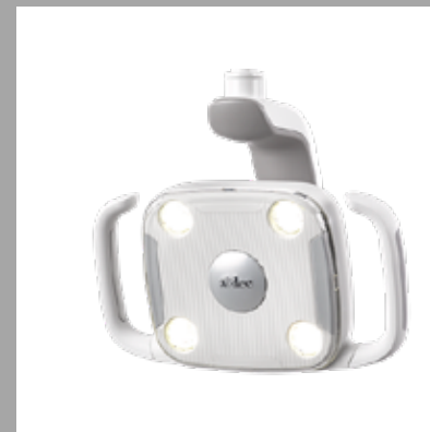
A-dec 300 LED